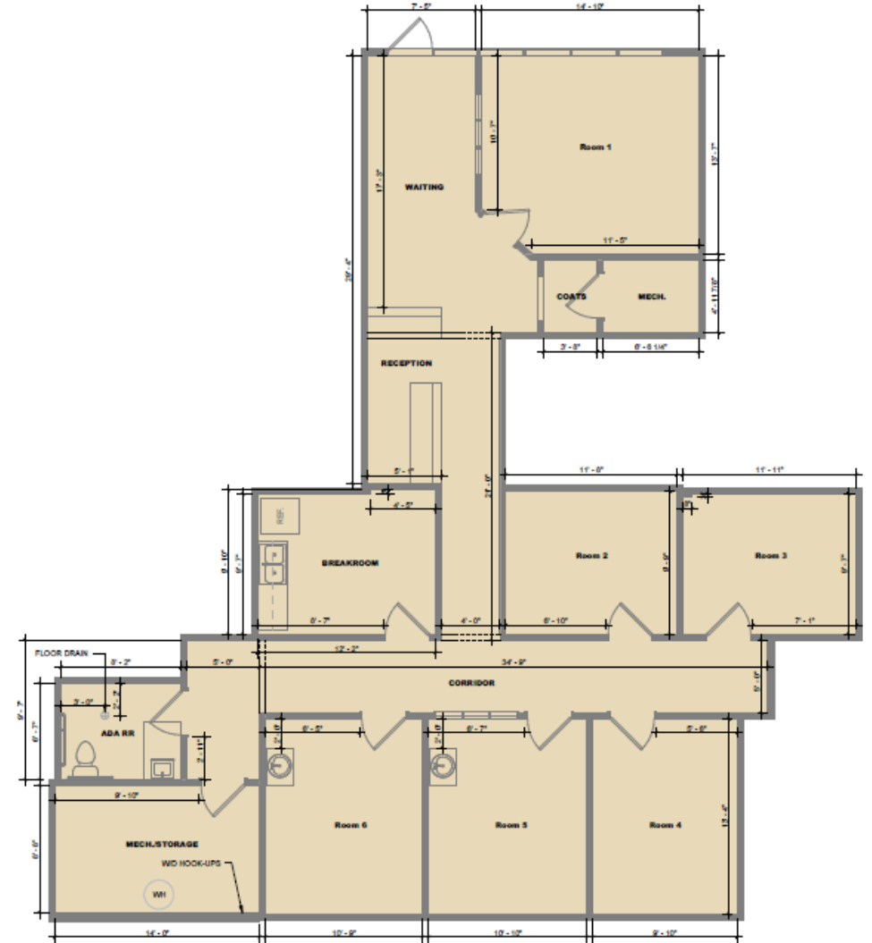
1 LEASING PLAN - 1,853 GROSS SF SCALE: 1/4" = 1'-0"

METHOD OF MEASUREMENT 1. GIA is generally measured from the centerline of partitions that separate adjacent occupants, from the exterior surface of exterior enclosures. No deduction is made for columns, any structural elements or occupant voids are within GIA.