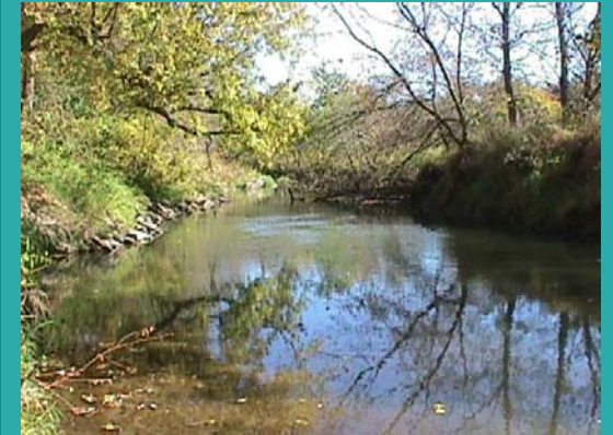
Walnut Creek Clive, Iowa