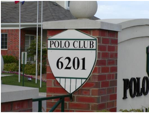
Address of Complex: Minimum 5" high, ½ inch stroke.