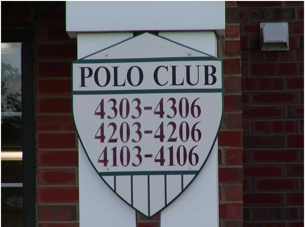
The first number indicates the building number (4000), the second number indicates the floor level (1=first floor, 2=second floor, etc.). The following numbers indicate the apartment number. Minimum 3 inch high, ½ inch stroke.