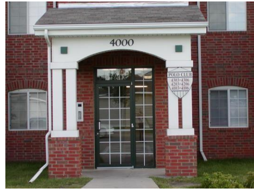
Building Number: Minimum 5" high, ½ inch stroke.